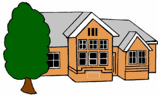
Cummersdale Primary School

Please note that school will finish for half term on Thursday 7 th February (this is due to a Dalston School Consortium INSET day on Friday 8 th February). School will commence on Monday 18 th February.